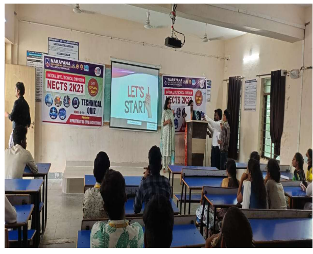
Technical Quiz & Cross Words