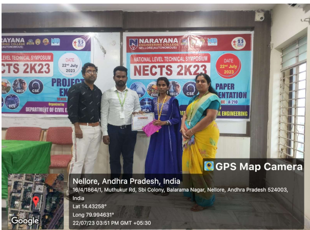
Certificate Distribution for all Students